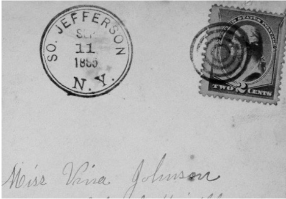
A postmarked letter from the South Jefferson Post Office.