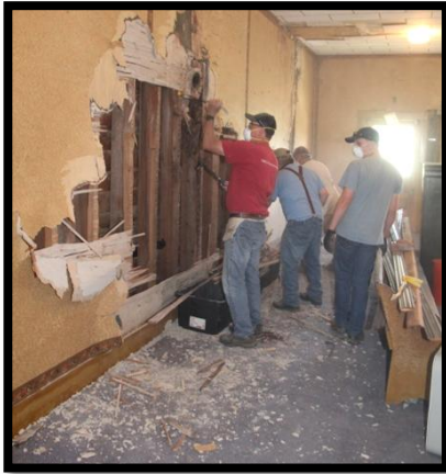
Start of restoration of upstairs in Judd Hall.