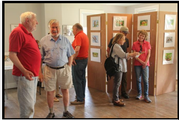
Bird photography art show by Barb Palmer