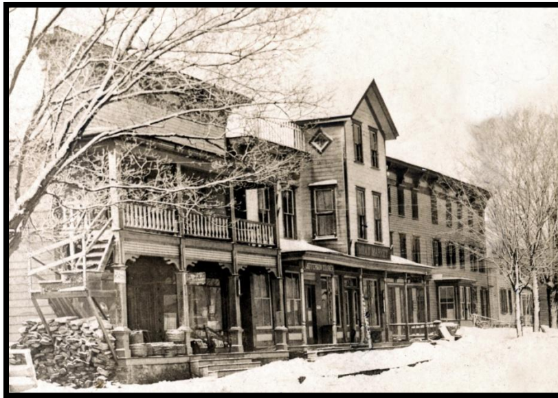
Main Street, Jefferson in the early 1900s: the hardware store (now the Breakfast Club), the Clark Block (now gone) and Hubbell's funeral home and furniture store (now gone as well).