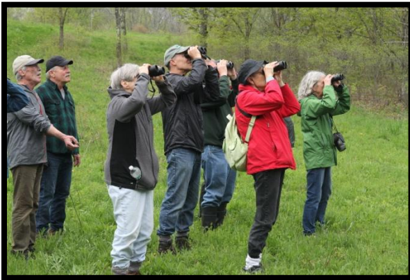
Bird walk at the Paulson Preserve