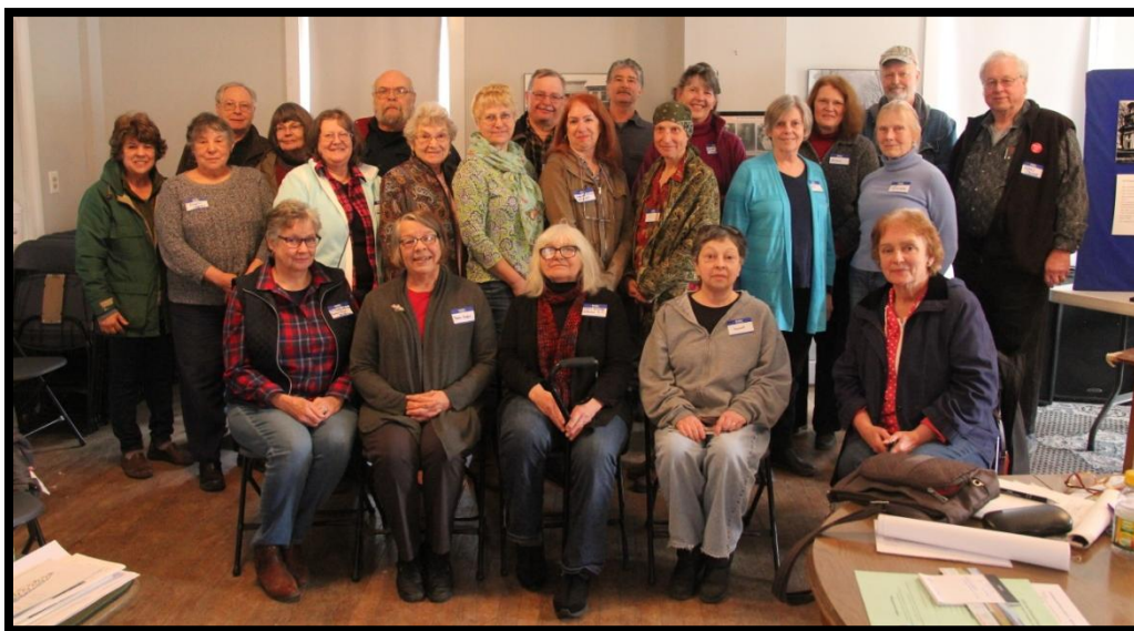
Meeting of historians and historical societies at Judd Hall.