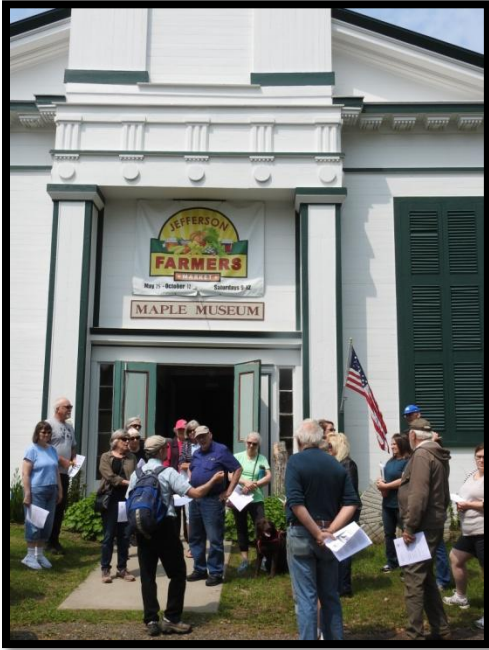
Start of historical Main St. walk.