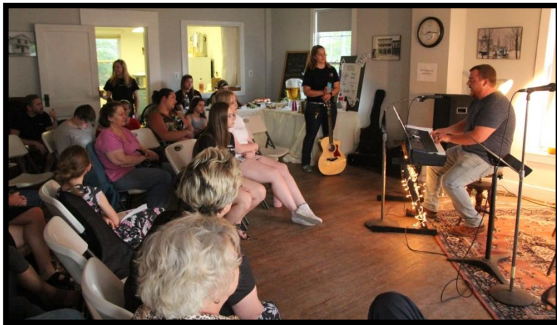
Open mic nights hosted by the Jefferson Central School Art Club