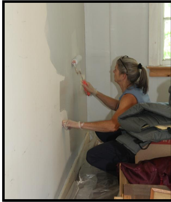
Painting Judd Hall walls.