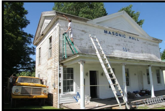
Priming of the front of Judd Hall.