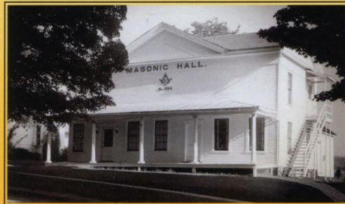
Judd Hall - New home of the Jefferson Historical Society, future local history museum and event venue. 163 Main Street, Jefferson